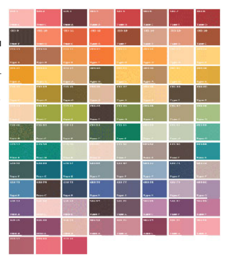
TM-30 measures against 99 color samples, all used to provide Fidelity (Rf), Gamut (Rg) and Color Vector Graphics

Released in 2015 99 color samples Measures Fidelity (Rf), Gamut (Rg) and includes Color Vector Graphic for detailed hues